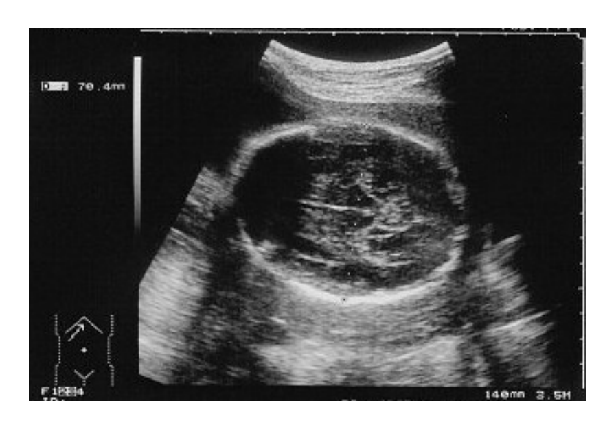
In this image, BPD = 70.4 mm